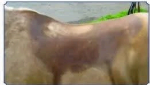
Dry spots in center of back indicate bridging.