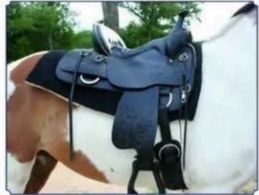
Great saddle fit-the saddle is level and there is adequate gullet clearance.