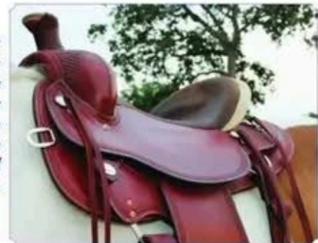
RIGHT: Saddle is too wide with gullet resting on horse's withers and tilted downward.

Improper saddle fit prevents the rider's weight from being distributed evenly through the bars of the saddle tree, resulting in pressure points, rub marks, soreness, or the development of white spots. Your horse's attitude under saddle can clue you in to a problem, but keep in mind that many a good horse will endure an ill fitting saddle until the damage becomes unbearable before complaining. So be proactive in evaluating good saddle fit for your horse.